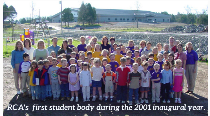
RCA's first student body during the 2001 inaugural year.

Those first families exhibited a great deal of faith in this young school. I sometimes marveled that they chose to take a chance on RCA. I have thought a lot about that over the years, and I believe they were motivated by two things. First, the energy, commitment, and dedication of our teachers in sharing God's love to their students was so evident. It was obvious that they had a heart for the ministry of Christian education and for the students and their families. Parents can easily recognize a true servant's heart, and they want their children learning from that kind of example each day. Second, despite all the challenges of that rustic campus, the hope for a better future lay just up the hill. The new 68,000 square foot building was under construction, and everyone could watch with excitement the progress that was being made each day. That new building represented an unmistakable commitment to the future, and parents knew the school was in it for the long haul. They were right.